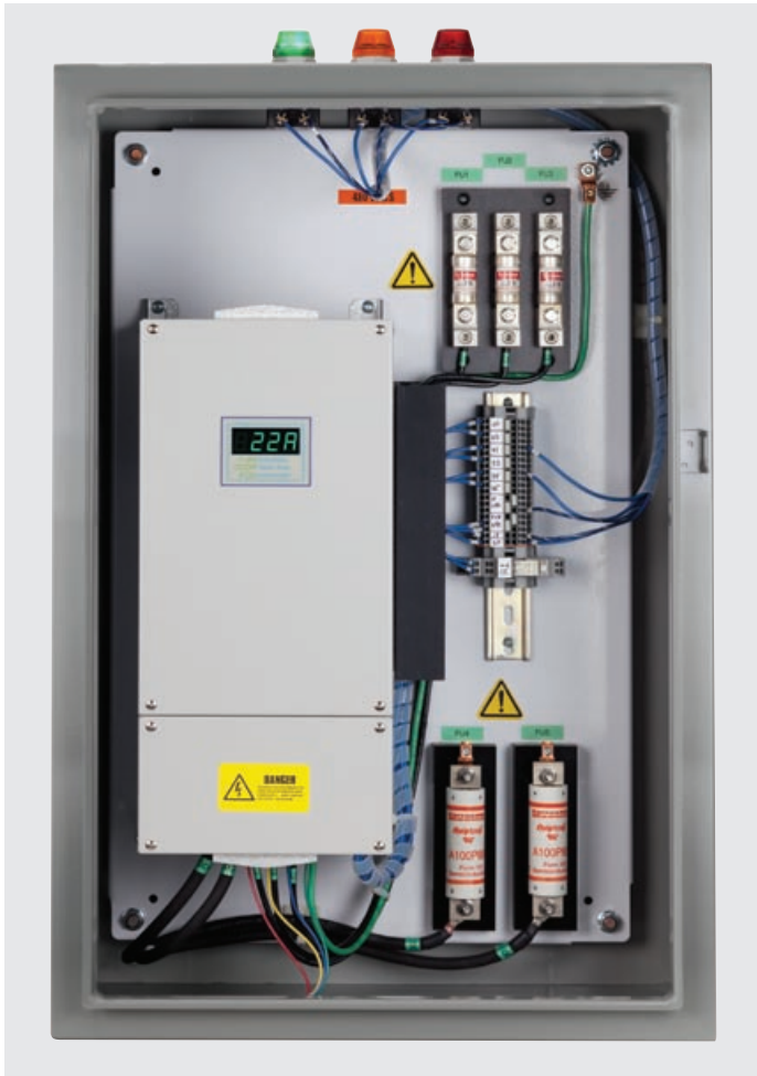
The Green LED indicator on the module provides an easy to recognize indication that the Schindler AC Regeneration Module is saving you money.

The Schindler AC Regeneration Module is a high performance line regeneration unit for elevator applications. When applied to an existing ACVF brake resistor drive, it saves energy by taking the excess regenerative energy from the motor and returning it to the AC power source. Additionally, the brake resistors generate less heat, reducing the need to cool the machine room, providing further savings.