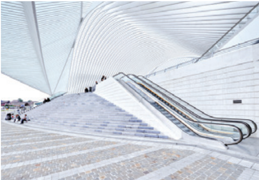
Exposed to the elements, rugged yet graceful Schindler escalators bring visitors and passengers in and out of the Liège-Guillemins station.