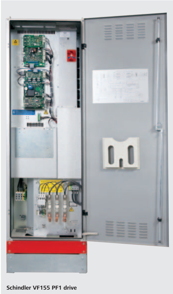
Schindler VF155 PF1 drive

Regenerative drives return energy back to your building's power grid to be used for other power needs in your building. Essentially it's like spinning your electric meter backwards. Schindler can provide regenerative drive technology to substantially improve the energy efficiency of your elevator system, whether your building has geared or gearless traction equipment.