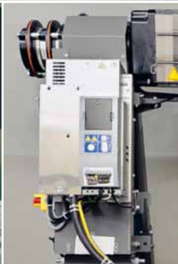
Electronic regulation system