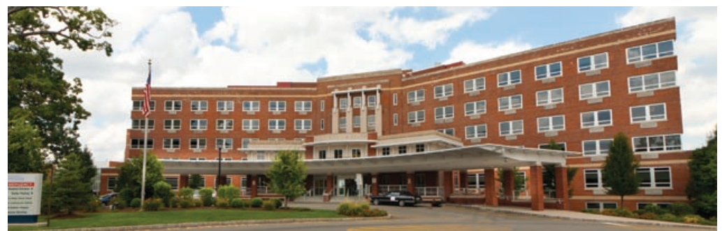
Photo left: Most patients and visitors enter Morristown Medical Center through the main entrance, which features the newly designed Simon-1 Lobby Photo below: The lobby of the Gagnon Cardiovascular Institute, where more open heart surgeries are performed each year than at any other hospital in the state.