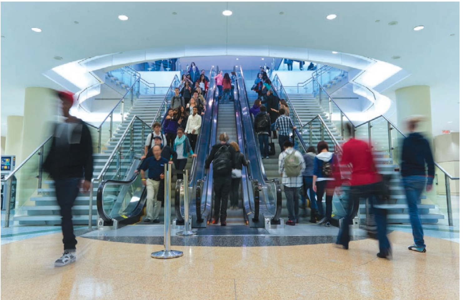
As many as 40,000 visitors attend a single event at the Metro Toronto Convention Centre. Schindler services all of the escalators and is reconfiguring the direction flow within the facility.