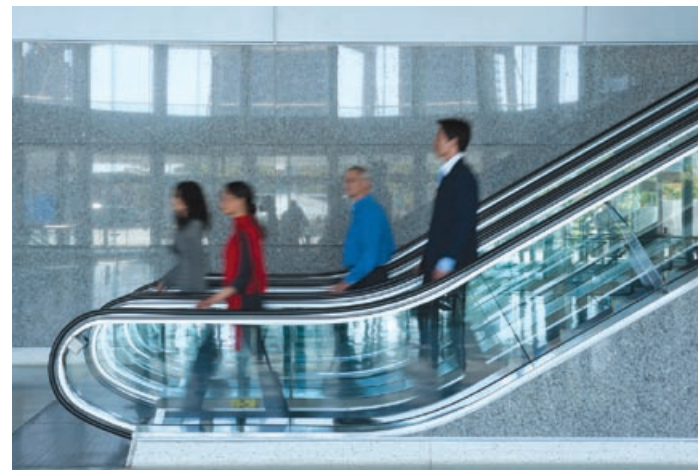
The escalators serve visitors as they travel between the three floors in each of two buildings that comprise the Centre.

Constructed in 1984, the Metro Toronto Convention Centre is large enough to accommodate virtually any gathering. It encompasses more than 2 million square feet of exhibit and meeting space, includes 64 meeting rooms, a world-class 1,330-seat theater and two spacious ballrooms. Up to 40,000 visitors attend a single conference, meeting or trade show at the venue, which has hosted a number of notable events, including the G7 conference in 1988 and the G-20 summit in 2010. Recently, the Metro Toronto Convention Centre was host to Greenbuild 2011, an annual international conference and exposition conducted by the U.S. Green Building Council (USGBC). Its purpose is to educate attendees on building sustainably, while showcasing the latest in products and services designed to demonstrate that going green can grow businesses.