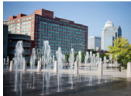
The Humana Waterside building with nearby Louisville skyscrapers in the background