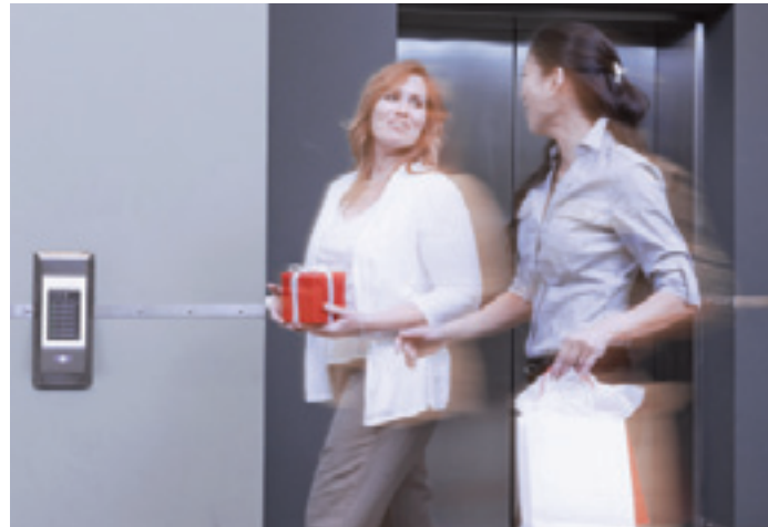
Photo left: The Schindler PORT terminal employs touch-screen and card reader interfaces. Photo right: PORT Technology adapts to passenger schedules and requirements.