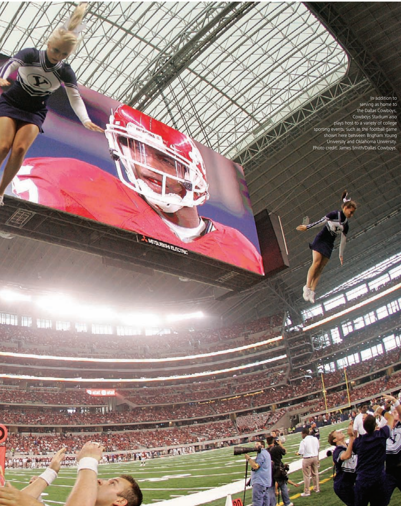
In addition to serving as home to the Dallas Cowboys, Cowboys Stadium also plays host to a variety of college sporting events, such as the football game shown here between Brigham Young University and Oklahoma University.