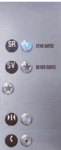
Photo left: Cowboys Stadium under construction. Photo middle: Schindler escalators are visually integrated with a variety of artwork collections throughout the stadium. Photo right: Schindler elevator car station with custom Dallas Cowboys star buttons.