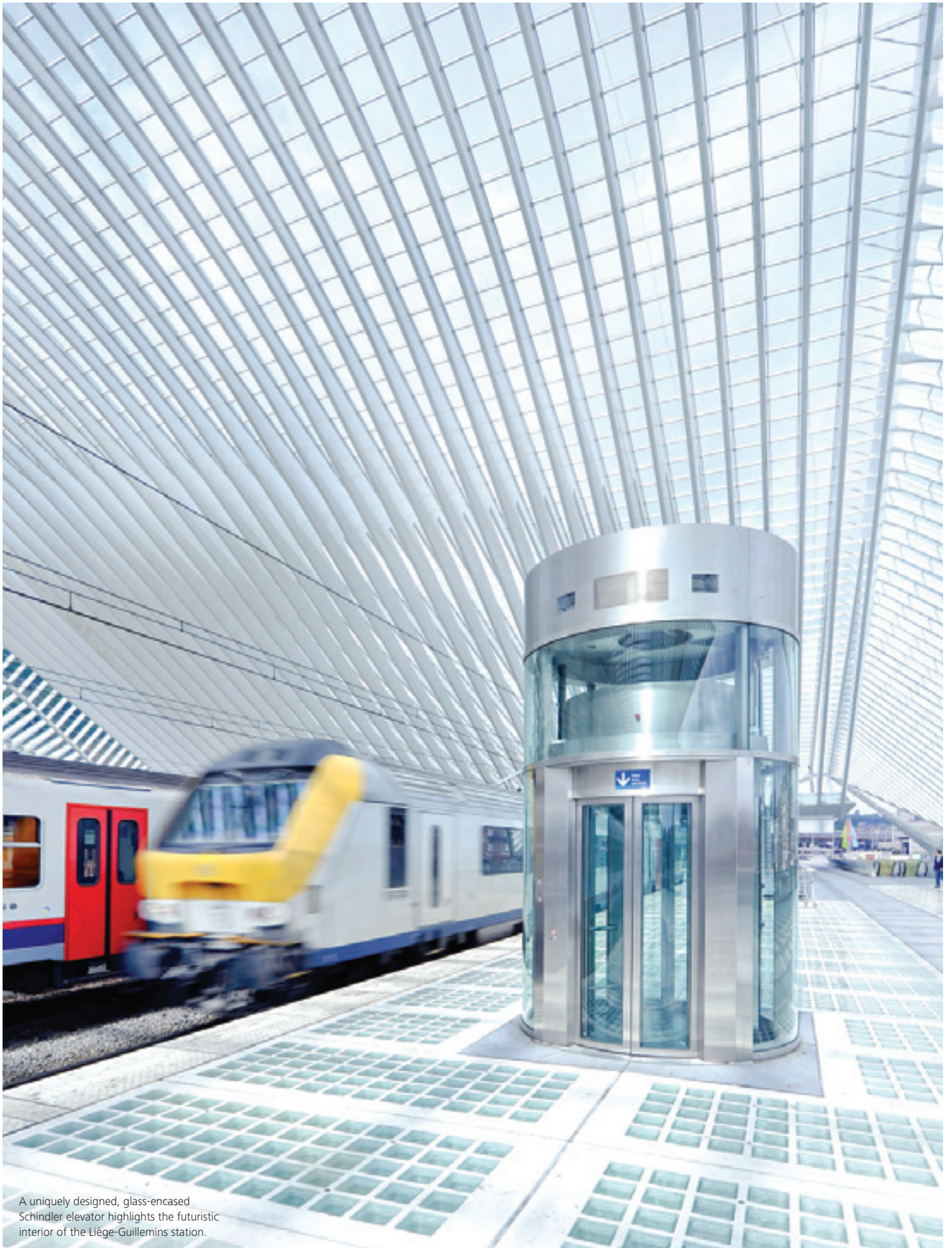
A uniquely designed, glass-encased Schindler elevator highlights the futuristic interior of the Liège-Guillemins station.