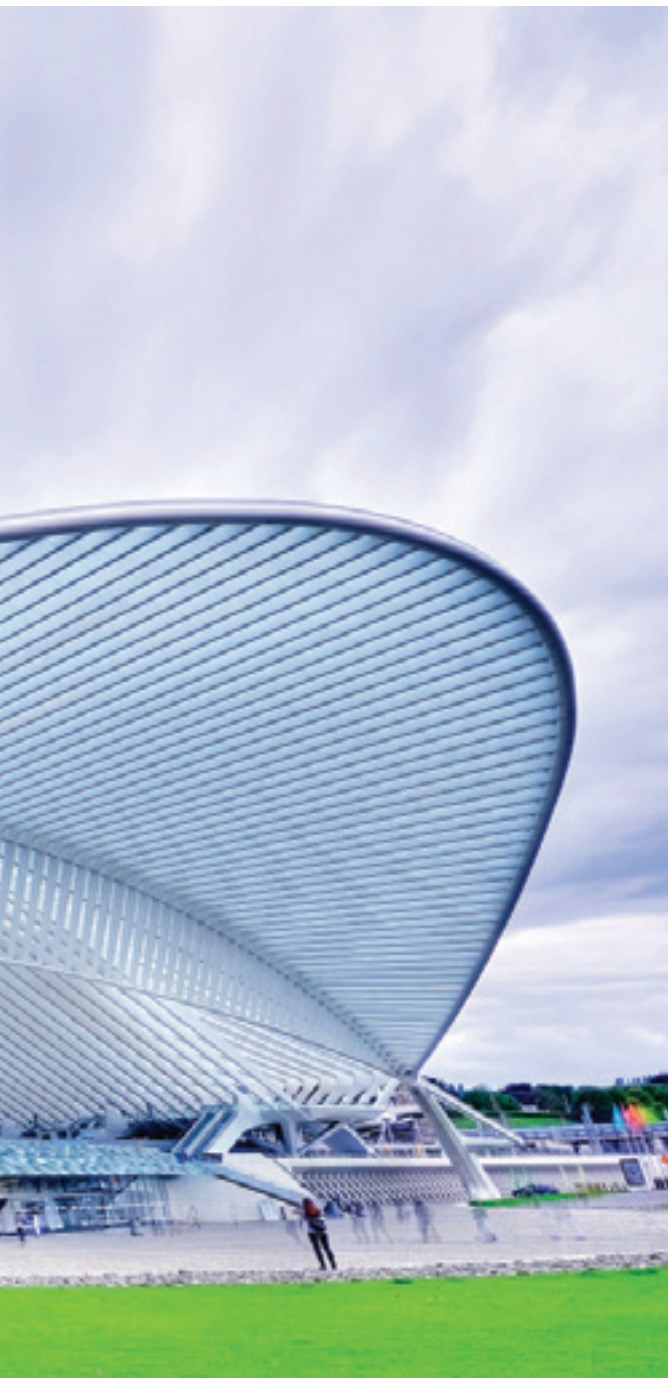
Photo above, left: The sweeping design of the Liège-Guillemins station presents an elegant complement to the surrounding countryside. Photo above, right: A Schindler escalator connects passengers to the rail departure and arrival level.