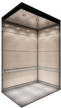
Beigewood Horizon Horizontal laminate panels LED downlight ceiling.

New fixtures and cab interiors* are the finishing touch to a complete elevator modernization. They make a lasting impression on your tenants.