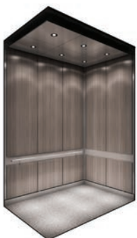
Sterling Ash Vertical laminate panels LED downlight ceiling.