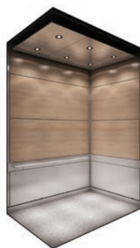
Natural Rift Horizontal laminate panels LED downlight ceiling.