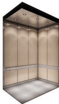
Beigewood Vertical laminate panels LED downlight ceiling.

*Cab interiors available with the Schindler HXpress ReNew package only.