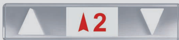
Hall lantern/position indicator