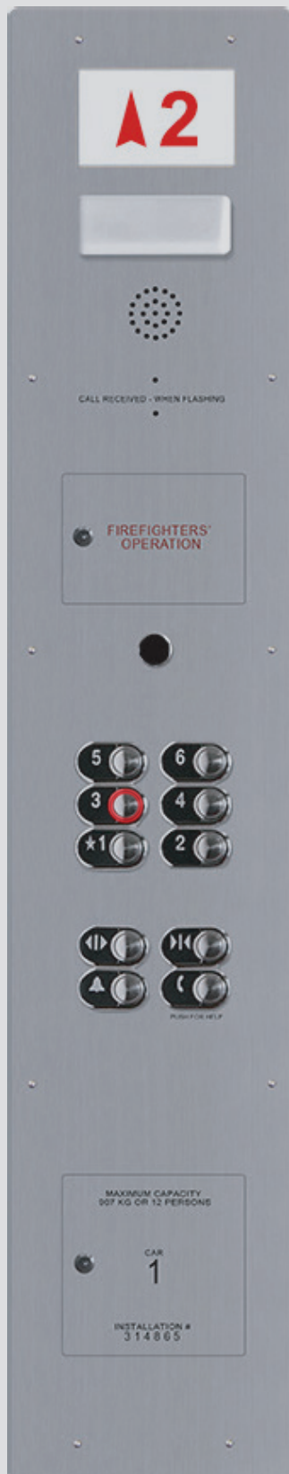
Car operating panel