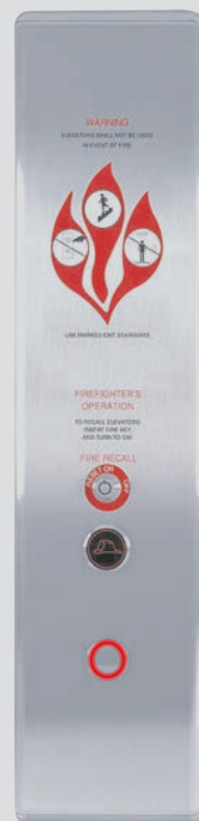
Hall pushbutton with fire recall