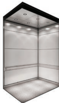
Frosty White Horizontal laminate panels LED downlight ceiling.