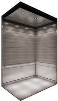
Boardwalk Oak Horizontal laminate panels LED downlight ceiling.