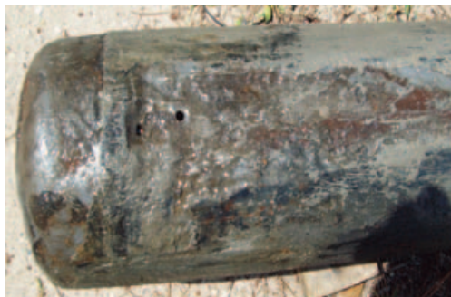
Photo shows where failure occurred due to corrosion that deteriorated the cylinder at or near the bottom welds.