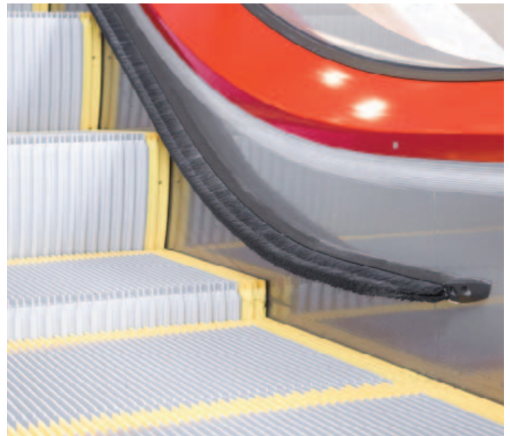
Skirt brushes help reduce step-to-skirt entrapments