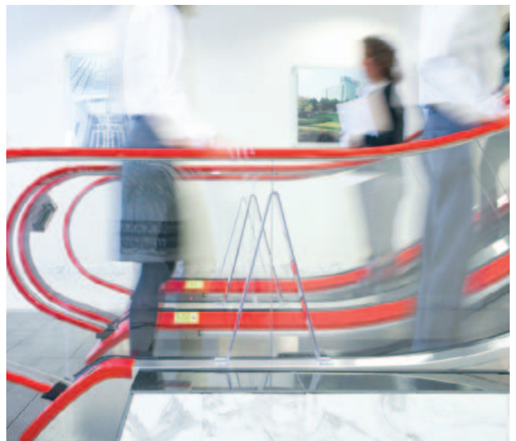
Upgraded escalators promote greater rider safety