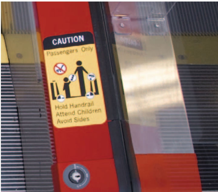
Handrail signs announce ridership rules

Schindler's Escalator Safety Kit is one more innovation that clearly demonstrates Schindler's commitment to providing products and services that can help keep your system running reliably, efficiently, safely and affordably.