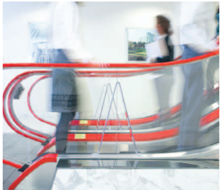
Upgraded escalators promote greater rider safety