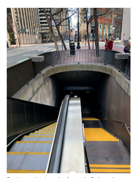
Escalator and staircase leading to the Embarcadero Station