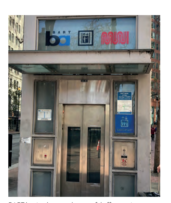
BART has implemented successful efforts to improve its elevators; photo by Jill Trent.

Besides simply being more comfortable, better BART stations with new (and clean) escalators "will make the system more reliable for riders, ultimately enhancing the commuter experience with equipment operating as it should, safely and efficiently, to help the public enter and exit the stations," Schindler says.