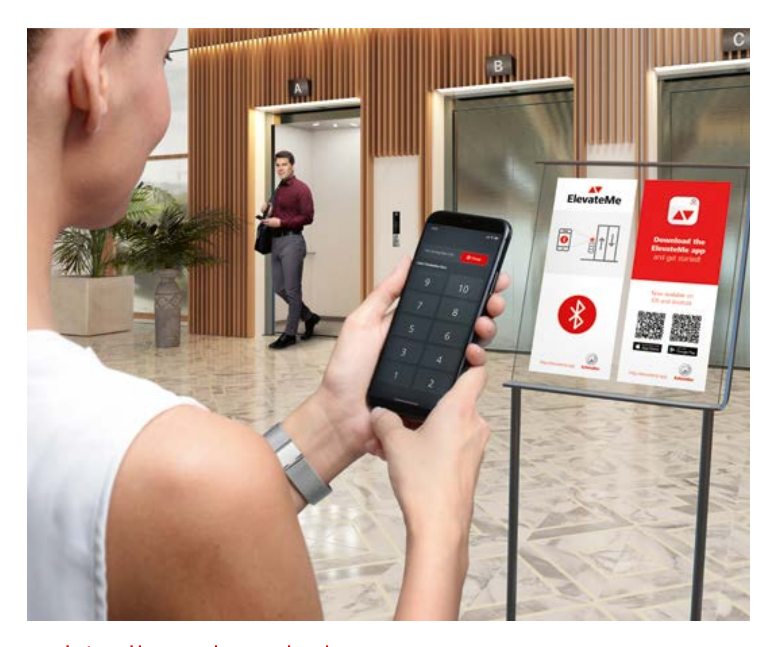
Schindler Ahead ElevateMe Elevator calls and more from smartphones