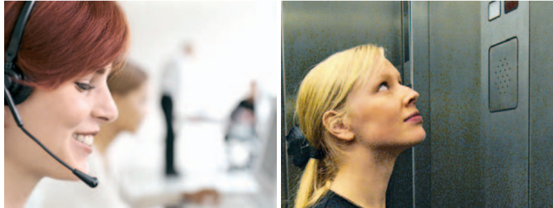
Schindler Servitel Service Center