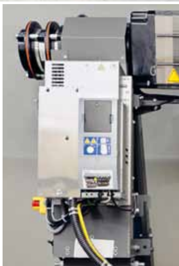
Electronic regulation system