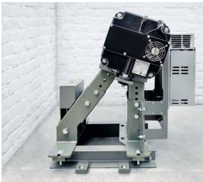
DR FMB 130