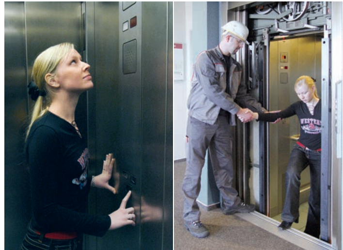
Rapid assistance at the press of a button. Rescue of trapped elevator users with AC TA and Servitel.

Play safe with the AC TA emergency call system. To suit your modernization needs, our specialists are looking forward to advising you on the optimum solution.