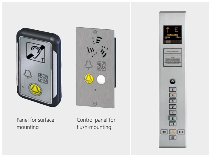
Alarm call panels for retrofitting to existing control system.

Telealarm, 24-hour availability and immediate response all form part of the service contract with Servitel. This means you always play safe.