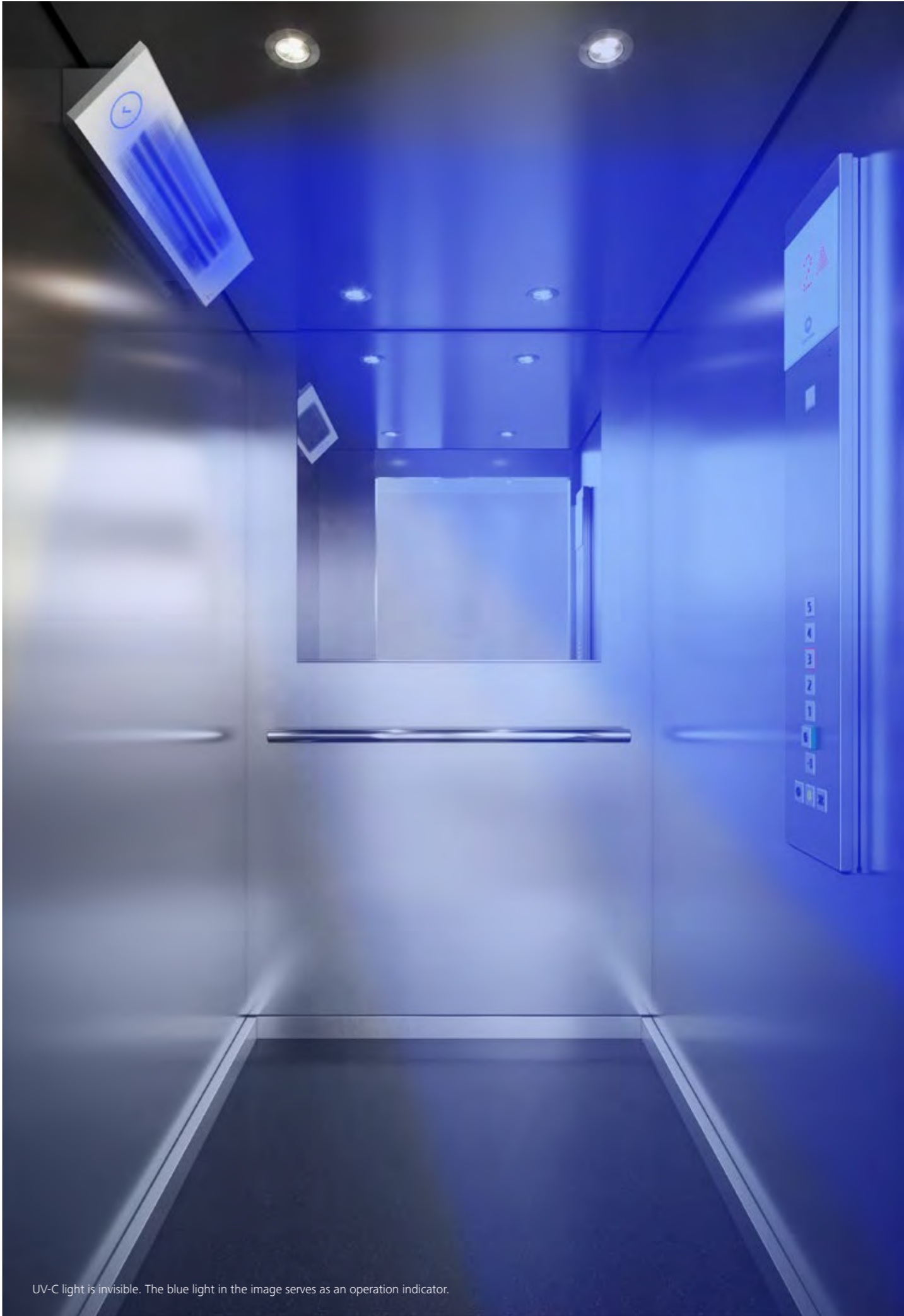
UV-C light is invisible. The blue light in the image serves as an operation indicator.