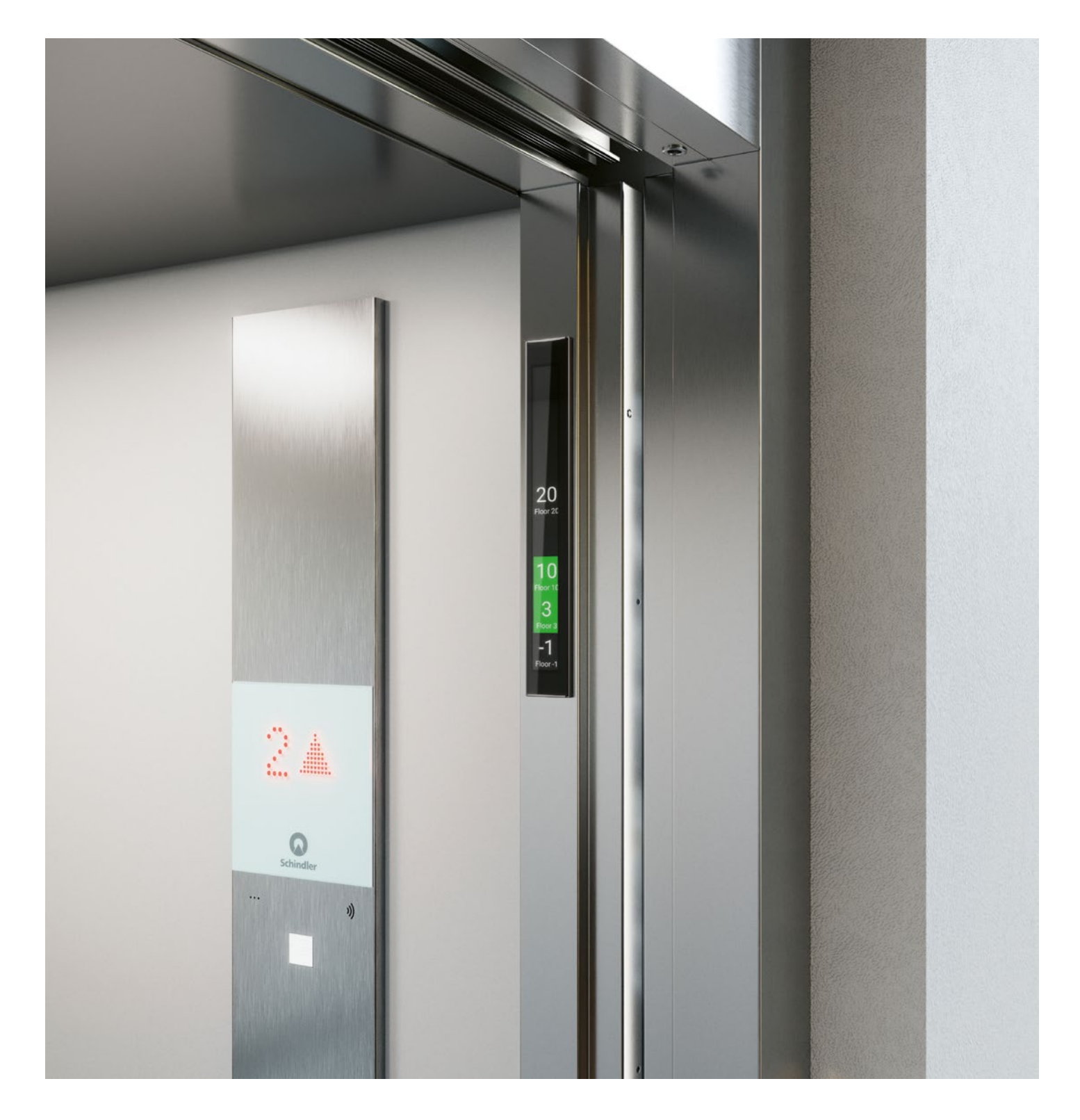
Schindler PORT Destination Indicator The display screen for elevator passengers