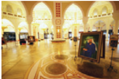
Photo far left: Shoppers take a refreshing break on the mall's Olympic-size ice skating rink. Photo left: The Gold Souk atrium immerses visitors in time-honored Arabic design.