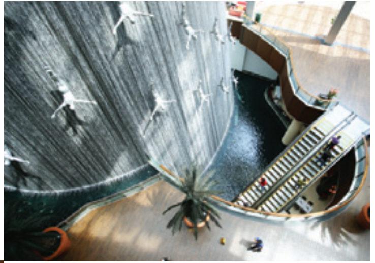
Photo below: This graceful waterfall with sculpted divers provides movement and a natural backdrop in the mall lobby.