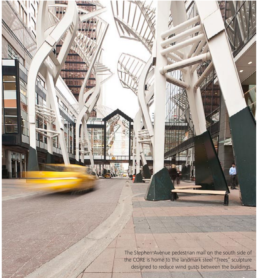
The Stephen Avenue pedestrian mall on the south side of the CORE is home to the landmark steel "Trees" sculpture designed to reduce wind gusts between the buildings.

With a population of more than 1 million, Calgary is Canada's third-largest city, situated about 50 miles east of the Canadian Rockies. Because of its proximity to the mountains of western Canada, the popularity of the Calgary Stampede rodeo, and its reputation as the "Nashville of the North" in terms of country and western music, Calgary's multicultural diversity is sometimes overshadowed by a romanticized "Old West" characterization. But Calgary is also a bustling, cosmopolitan city offering a wide range of cultural attractions and a growing economy.